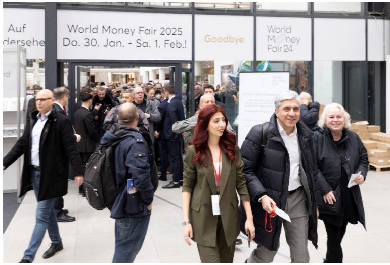
Caption: Large crowds of visitors at the World Money Fair 2024: 300 exhibitors from 50 nations showcased valuable collector's items in Berlin.